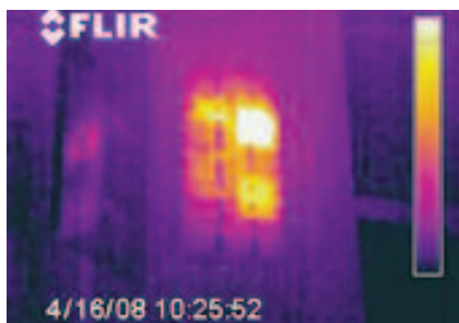
A possible overloaded circuit