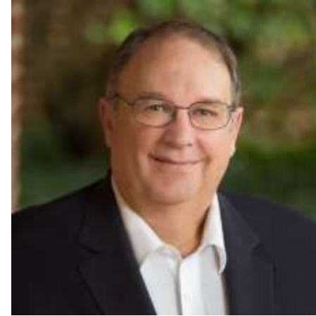
Duke Williams Simple Easier Payments / EchoSage